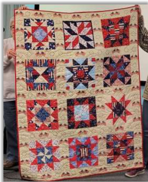
Kenda Camp - Quilt of Valor