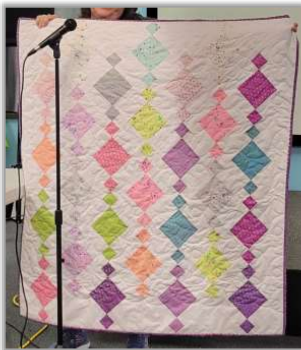
Jenny Boudreaux - Chandelier