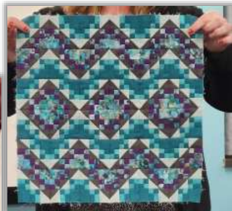
Jean Spohrer, 3 small quilts (1 JOCO Fair blue ribbon)