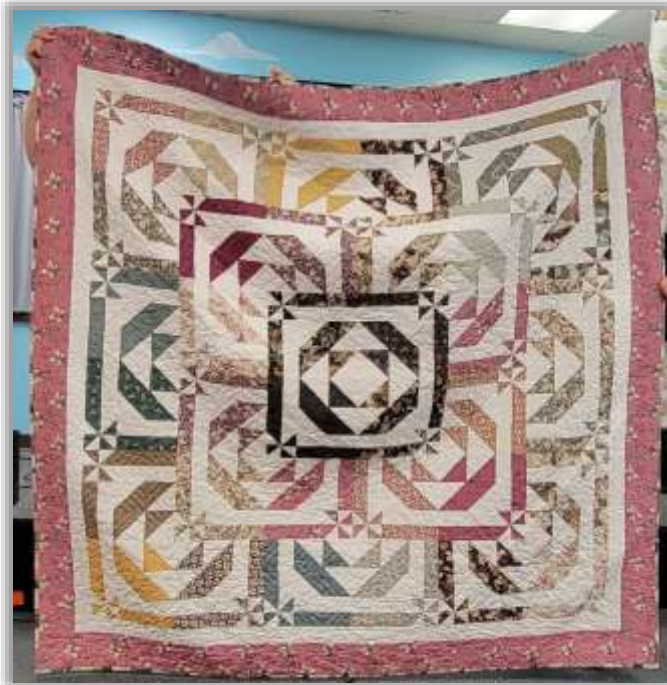
Kathy Reed, disappearing pinwheel illusion