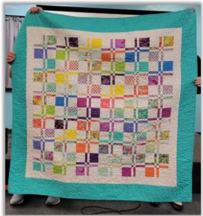
Jenny Boudreaux, disappearing 4-patch