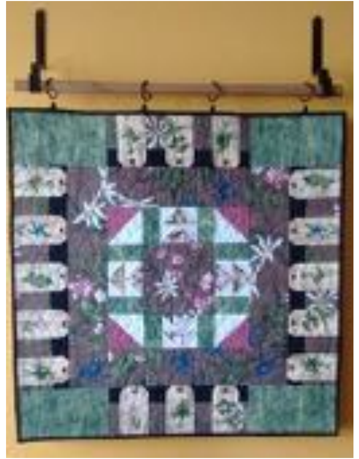
Shelia Pierce (2 wall hangings)