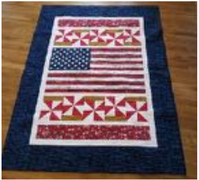
Gretchen Ryan (2 quilts)