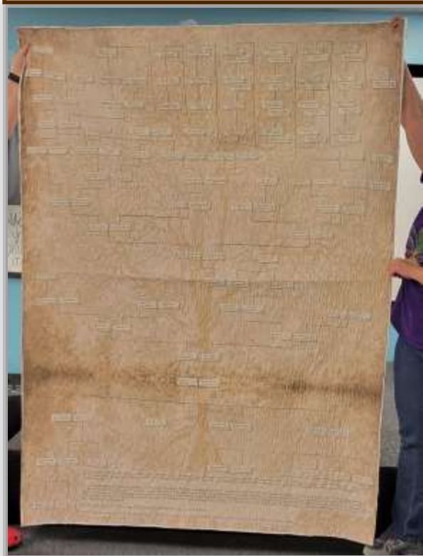
Heather Buchwitz—Family Tree