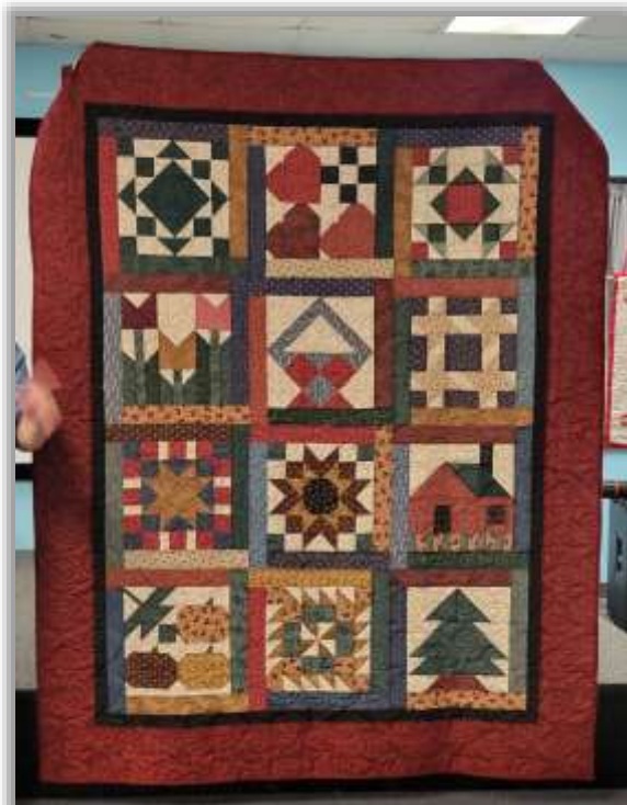
Kenda Camp—Thimbleberries calendar