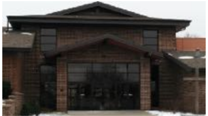
West (main) entrance - use for hand quilting group