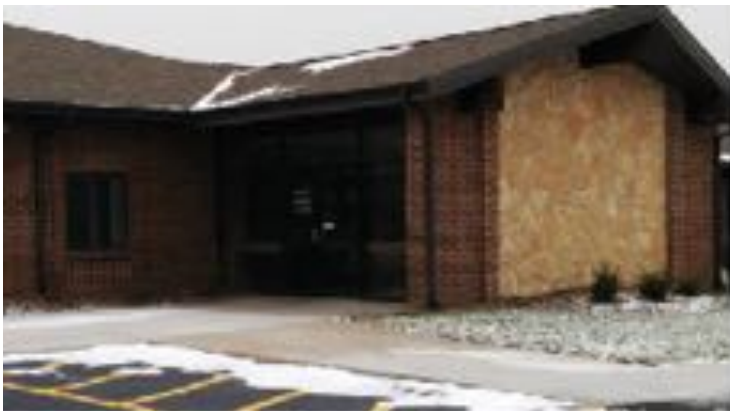
East entrance - use for regular guild meetings

Olathe Christian Church - entrances from main parking lot: