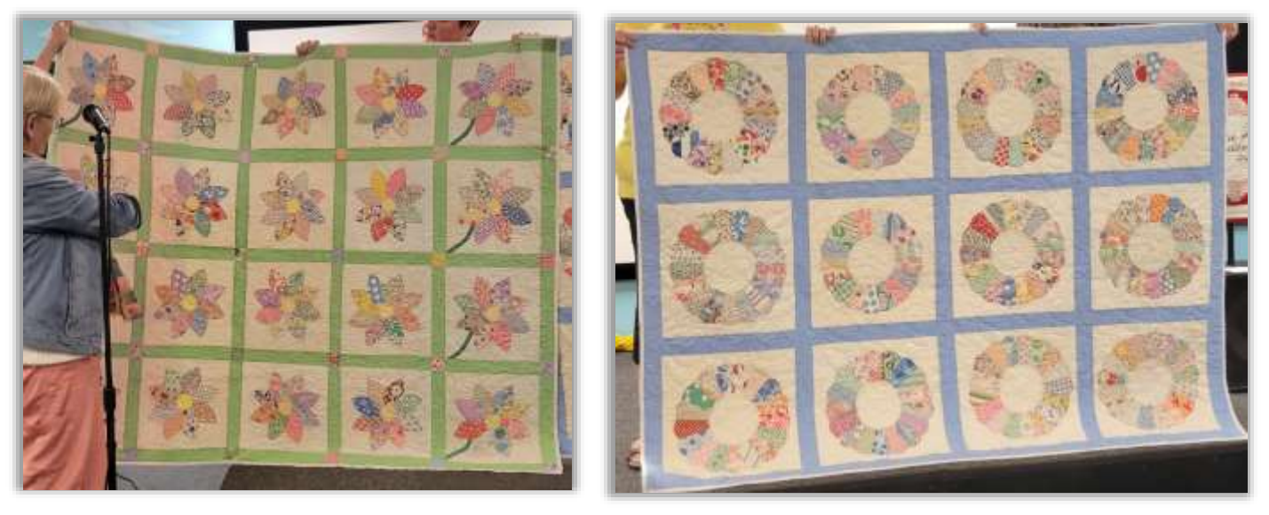
Laurie Vanderpol - 2 quilts of grandma's blocks