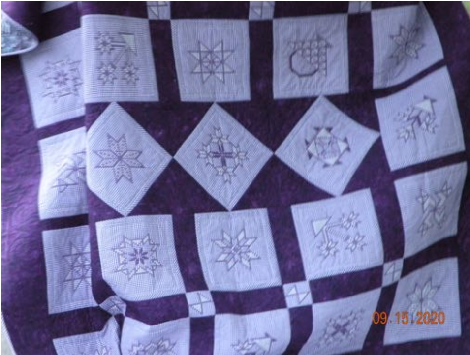
Janis Raspberry chicken scratch embroidery quilt