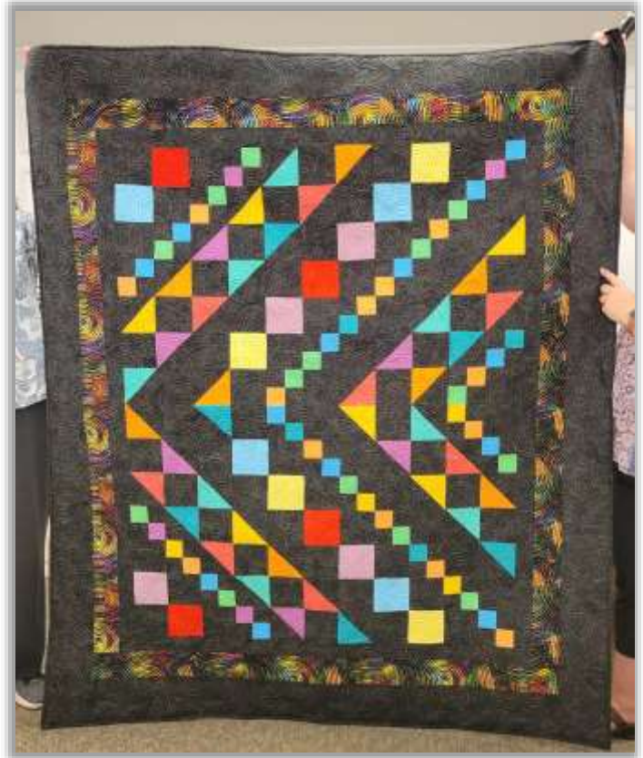
Carol Crane—Modern scrappy