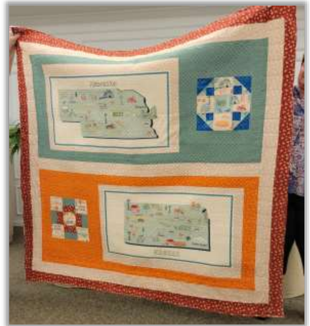
Front and back